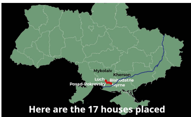
Here are the 17 houses placed