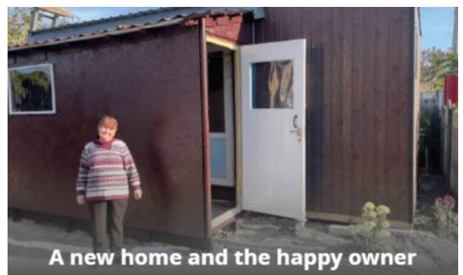
A new home and the happy owner