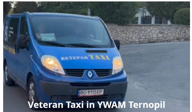
Veteran Taxi in YWAM Ternopil