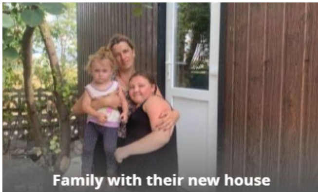
Family with their new house

from the base drives war veterans to and from the hospital and other places. The need is great and the opportunities are few for those who have been injured in the war. Our gift goes to fuel, winter tires and various repairs on the cars.