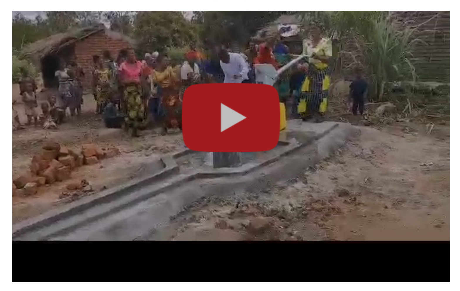
A musical thank you from the village of Salule.