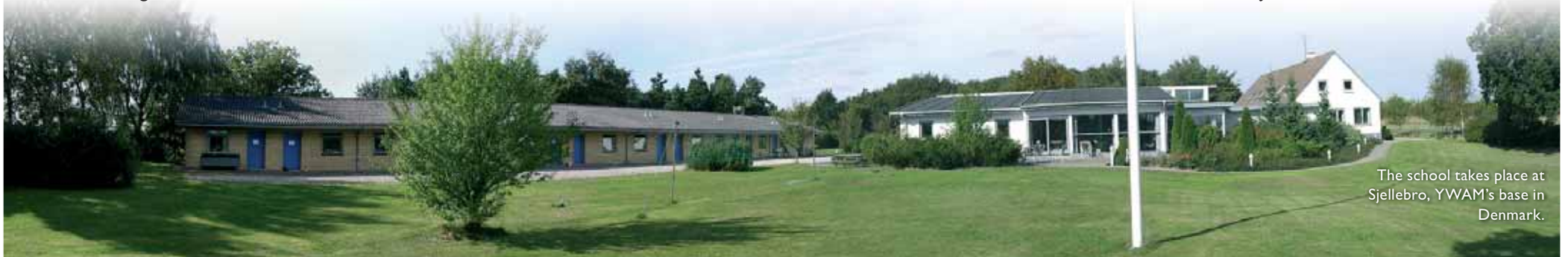
The school takes place at Sjellebro, YWAM's base in Denmark.